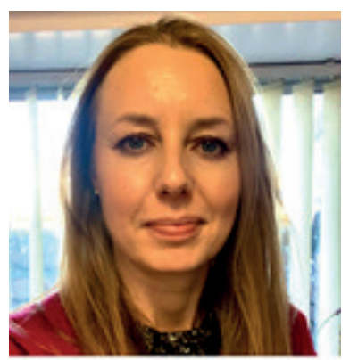
ACPGB Chair Education & Training Committee